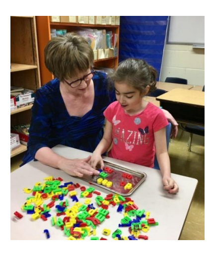
Fig. 2. Photo of the teacher and her pupil on the schoolteacher's website Ms. Cassidy's Classroom Blog (https://mscassidysclass.edublogs.org)