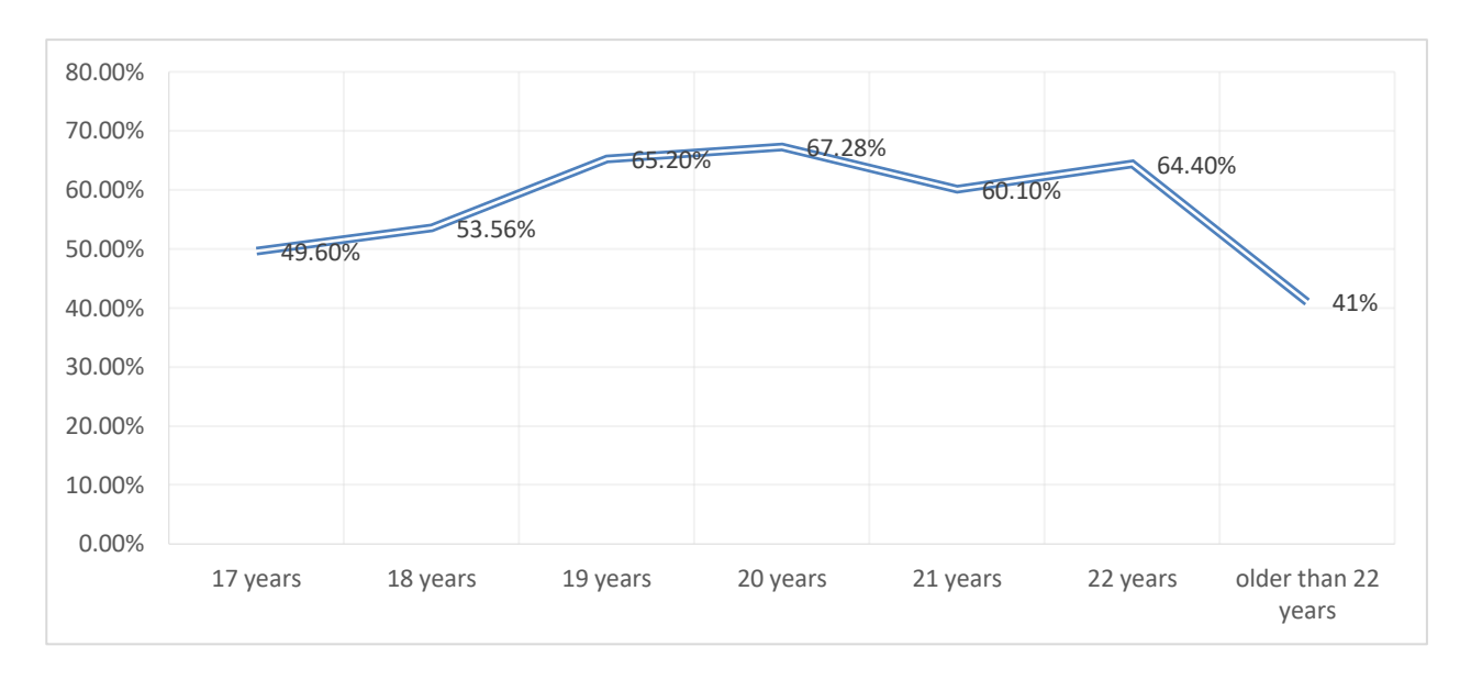
Fig. 1. Media Literacy Levels According to Age (percentage)

The last criterion to differentiate the results is respondent's major (i.e. political science, international relations, forensic analysis, and customs procedures). As none of them has previously taken courses somehow connected with media literacy (and there is no such a course at Saratov State University at all), I could not compare their results with those of control group.