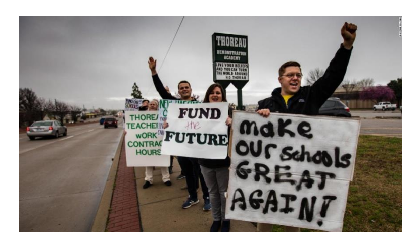
Fig. 1 . CNN Website photo of teachers walkouts in Oklahoma and Kentucky (https://edition.cnn.com/us/live-news/teachers-walkout-oklahoma-kentucky)

The teachers' protests concerned not only unpopular educational and financial policies of the government, but also mass and violent shootings and killings in USA high schools; the last occurred in Texas and Florida. In this connection, mass walkouts of teachers against the use of armed violence in schools of Arizona, West Virginia and other states resumed. In February 2018, after the sad events in Florida, an organization of public activists, mainly students, teachers and parents named Never Again was established. Their mission is "to serve people in danger, connecting at-risk individuals and communities with industrial-grade tech solutions to face some of the boldface problems of our shared world" and "strengthen public safety and respond to violence and harm in real time" (http://neveragain.org).